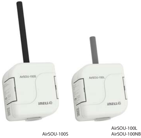
AirSOU-100S AirSOU-100L AirSOU-100NB